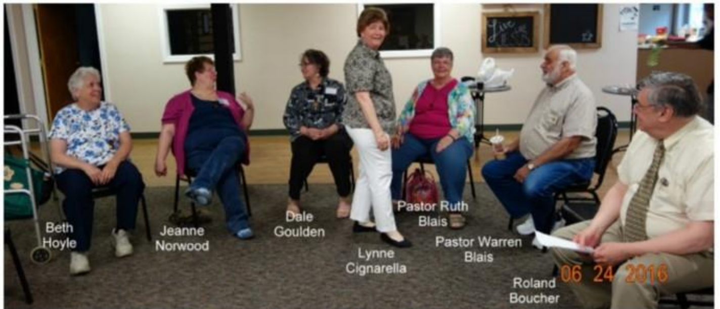
Reunion Secuela - Praise Tabernacle N.