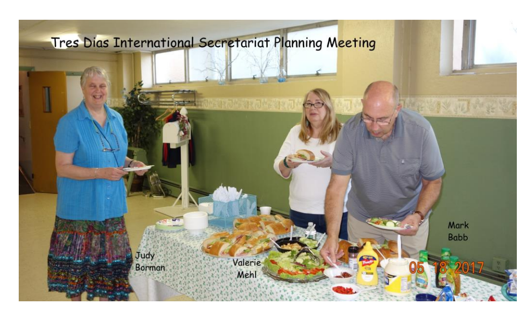
May 18, 2017 - Tres Dias International Secretariat Planning Meeting