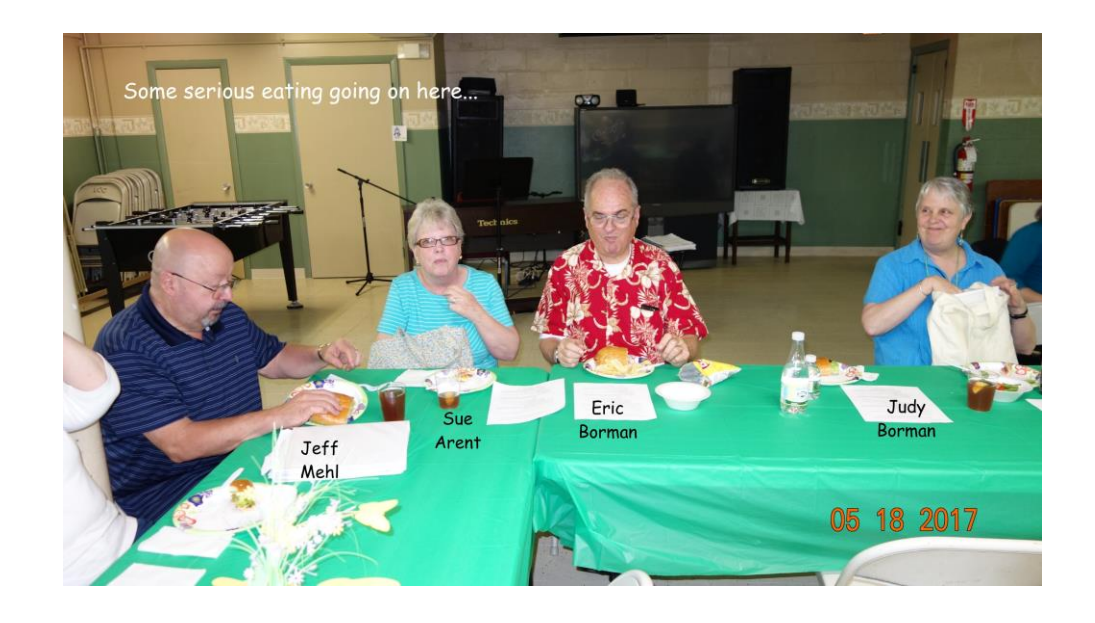
May 19, 2017 - Reunion Secuela - Trinity Episcopal Church